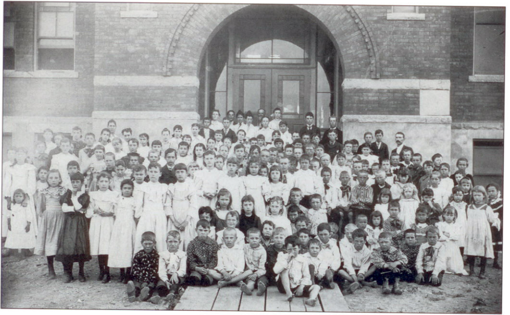
This picture features the class of 1895 at what was known as the Dearborn Public School. Bricks from the arsenal were incorporated into the structure when it was built in 1893 on part of the old arsenal grounds. This structure was also used for high school classes until 1925, when a larger building, known as Dearborn High School, was built on Mason Street. That school is the present day Ray H. Adams Junior High School.